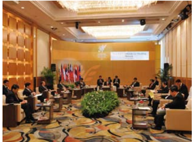
41 st AMM Retreat, 21 July 2008, Singapore

To effectively realise the APSC, the adopted APSC Blueprint is an action-oriented document with a view to achieving results and recognises the capacity and capability of ASEAN Member States to undertake the stipulated actions in the Blueprint.