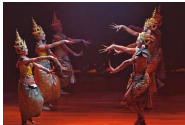
Cultural night - Commemorating 20 years of ASEAN-ROK relations