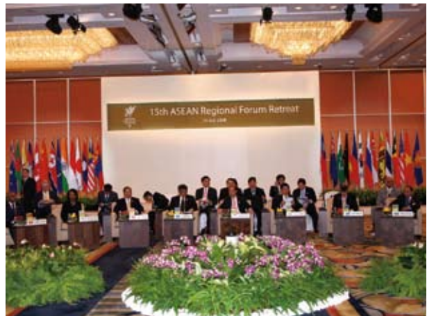
15 th ARF Retreat, 24 July 2008, Singapore