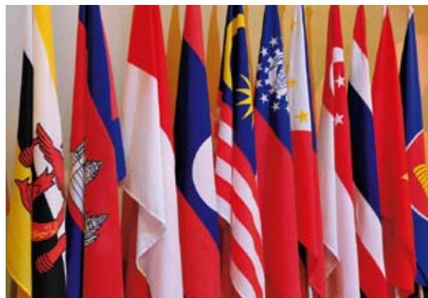
Flags of ASEAN Member States