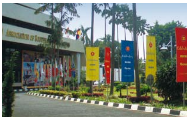
ASEAN Secretariat welcomes the entry into force of the ASEAN Charter

In his remarks, H.E. Dr. Surin Pitsuwan, the Secretary-General of ASEAN, pledged to protect and uphold the ASEAN Charter in letter and in spirit for the benefits of all the peoples of ASEAN.