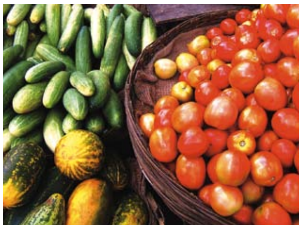
Healthy food for healthy people