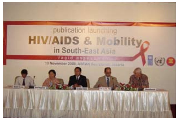
Information dissemination on HIV/AIDS

Going forward, the ASCC will continue to intensify cross-sectoral coordination and cooperation and strengthen partnership with civil society, academia and private sector. Building a caring and