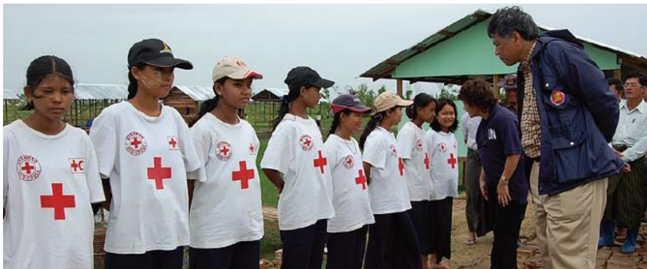
SG Surin meets participants of the ASEAN volunteers' programme in Myanmar

In early May 2008, Cyclone Nargis made landfall in Myanmar, causing extensive damage in Yangon and the Irrawady Delta, causing widespread destruction and taking nearly 140,000 lives. One year later, much has been achieved in responding to this disaster and much of this can be attributed to the work of the Yangon-based Tripartite Core Group (TCG) consisting of ASEAN, the Government of Myanmar and the United Nations.