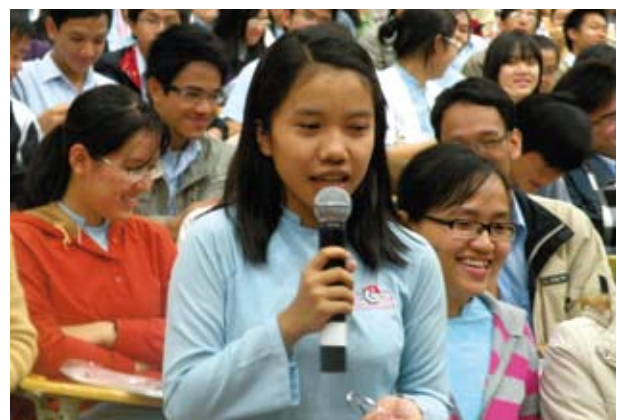
Raising an ASEAN awareness among high school students

sharing community is challenging, but ASEAN remains strongly determined and committed towards the well-being of its people, especially the vulnerable groups.