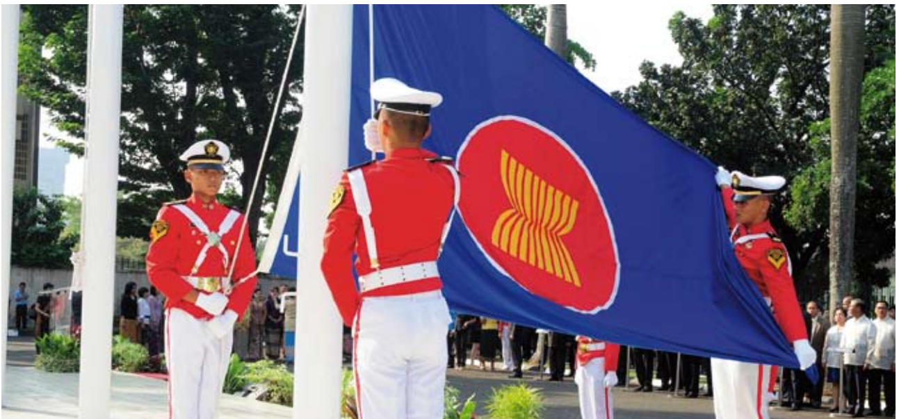
Flag Hoisting Ceremony on ASEAN Day, 8 August 2008, ASEAN Secretariat, Jakarta