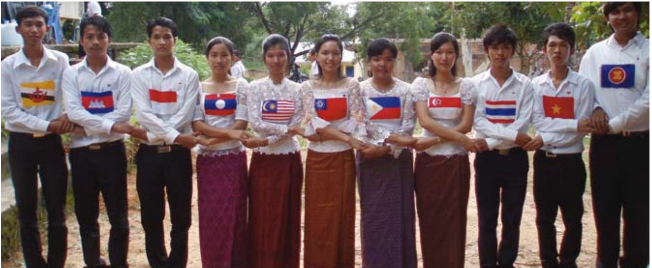
Representing the youth of ASEAN

Heads of State/Government of ASEAN– Cha-am Hua Hin Declaration on the Roadmap for the ASEAN Community 2009-2015